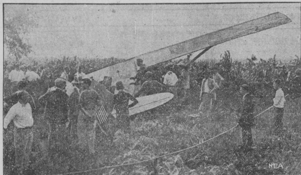
First picture of the wrecked plane, Greater Rockford, shown in a cornfield five miles from Rockford, Ill., following the unavoidable plunge Thursday, which pilot Bert Hassell and navigator Parker Cramer blamed on excessive weight and loggy air conditions. They proposed to fly to Stockholm, Sweden, via Mt. Evans, Greenland.