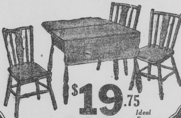
Table and 4 chairs, finished in genuine lacquer in your choice of colors.

The chairs are very sturdy and of pleasing design and the table is extra solid.