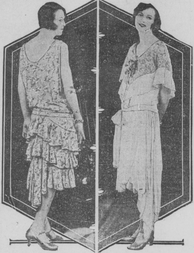
Left is one of Bendel's rose beige frocks for midsummer year. The filmy blue model at the right features a novelty skirt and old-fashioned berth.