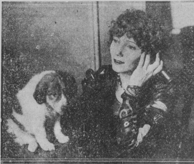
Miss Gilda Gray

Here is a brand new and unusual picture of Gilda Gray, the dancer, now at Loew's Palace. It shows Gilda and her new friend, a pretty little puppy.