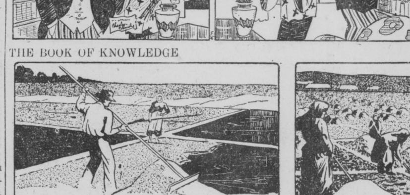
THE BOOK OF KNOWLEDGE