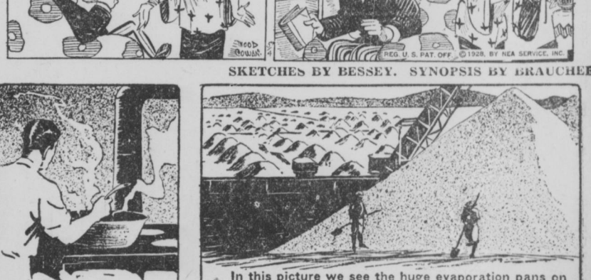
In this picture we see the huge evaporation pans on the shores of the Mediterranean at Benghazi in Tripoli. The sun having done the work and taken up the moisture from the brine, thousands of tons of salt are left behind. This method of making salt has been known since man first found the crystals on the edge of a rocky pool. (To Be Continued)