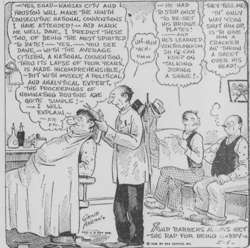
AND BARBERS ALWAYS GET THE RAP FOR BEING GABBY