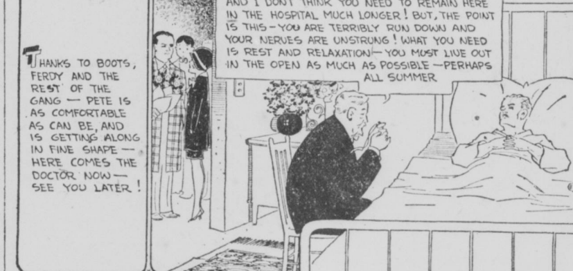
FRECKLES AND HIS FRIENDS