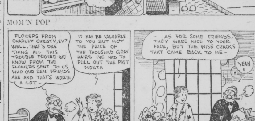
Best Daylight Features