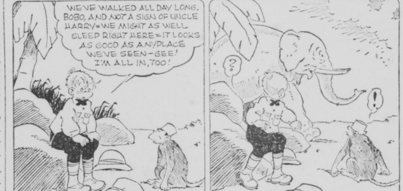
WASHINGTON TUBBS II