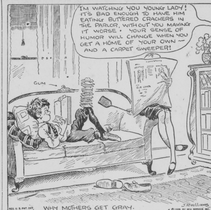
WHY MOTHERS GET GRAY.