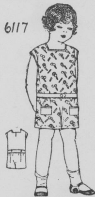
A SIMPLE ONE-PIECE "ROMPER" STYLE

B6117. Chintz, dimity, chambray, and all cotton prints are good for this model.