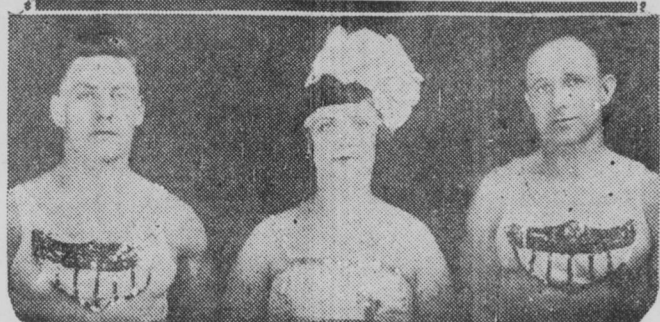
The "Flying Floys," who are to be seen this week at the Police and Firemen's Emergency Fund Circus at State Fairground.

with Chambers of Commerce in Latin America and according to its officers will avoid all official contacts in order to exclude politics from the convention.