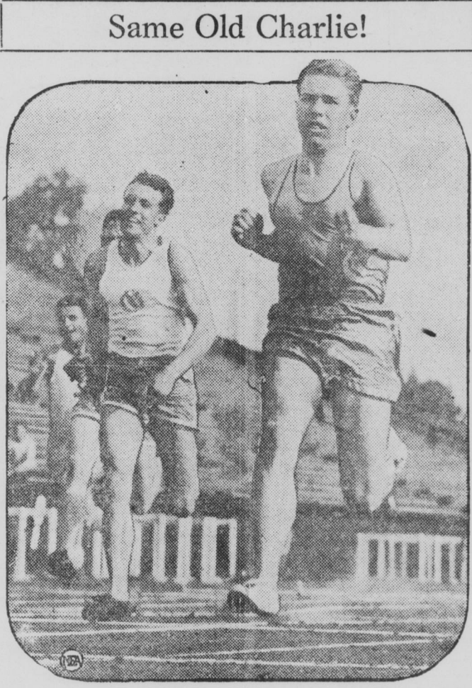
Same Old Charlie! Charlie Paddock, as indicated in the picture above, does not have to stay in high gear to win all his races. He is shown pulling up easily in winning the 300-yard dash in a recent meet between the Los Angeles A. C. and Stanford. That he is reaching top form was proven when he did 300 yards in 31 seconds in an attempt against the record of 30 2-5 seconds.