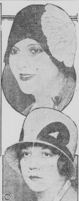
Instinctive with Milady at Easter (left to right): Braided straw in three tones of tan swathed a Bedouin turban of blue felt; (below) a tall straw hat with a cream linen straw turban and a shellacked black feather; rose beige bengal trimmed with ribbon tulip; lustrous sisal turban with white velvet flower and (below) purple feather trimming on a banana Italian straw.