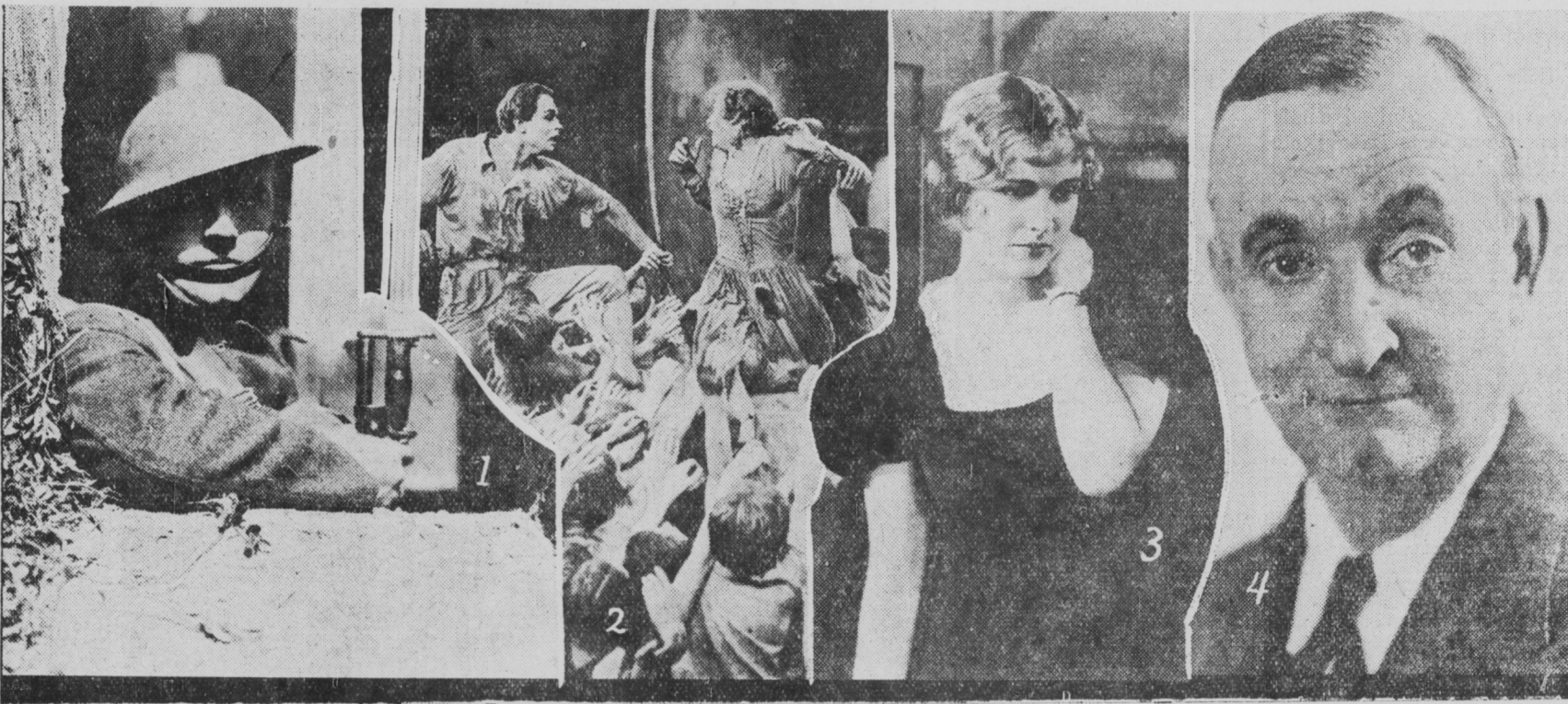
1—Richard Barthelmess opens today at the Circle in "The Patent Leather Kid" 2—A scene from "Metropolis" starting today at the Ohio.

First National's super-production, "The Patent Leather Kid," comes to