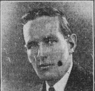
Note: See other cases reported daily—all certified by a member of the hospital clinic.

With the first swallow he felt its comforting, healing warmth—from his nose passages deep down into his chest. Relief began instantly and the cold was clearing up noticeably in two or three hours. He continued the pleasant doses, and in another day or so, doctors report, there was no trace left of the cough or cold.