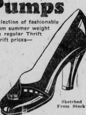
Sketched From Stock