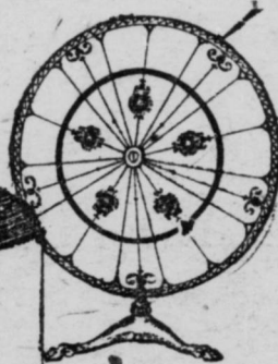
Fada Neutrodyne Receivers, table and furniture models; 8, 6 and 5 tubes—$85.00 to $400.00.

Fada S. table type loop operated—loop nests in cabinet cover. Total individual stage shielding. Four stages radio frequency. $300.00.