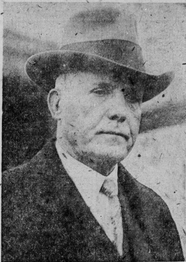
Senator James A. Reed, chairman of the Senate slush committee, as he arrived here from Chicago this morning to continue his inquiry into the Indiana political scandal here.

By Times Special NEW YORK, Oct. 22.—Mayor "Jimmy" Walker, who likes a night club as well as the next man, saw his 3 a. m. curfew law slide quietly through the upper branch of the municipal assembly Thursday.