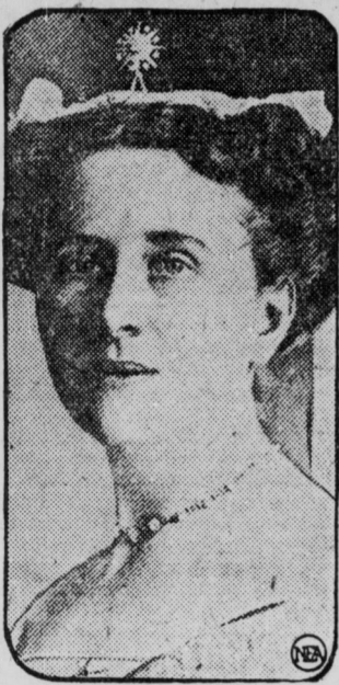
This is Frau Dr. Mathilde von Kemnitz, distinguished German doctor and writer, whose engagement to General von Ludendorf has been announced. The former chief of the German army was divorced by his wife about a month ago.