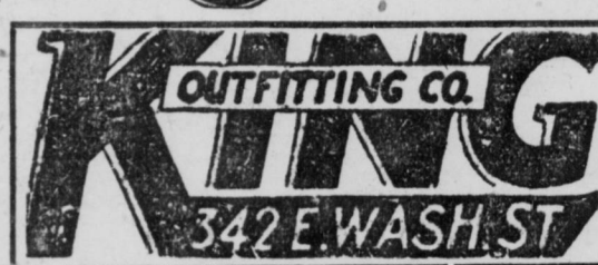
KING OUTFITTING CO.

Roll edge, biscuit tufted. Fine grade of art ticking— $7. 95