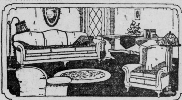
See This Marvelous 3-Piece

The sale that has set the whole town a-talking. Here you get what you want at low August Sale prices on the most liberal terms imaginable. Following are just a few of the many super bargains! Get here early!