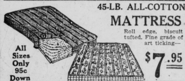
45-LB. ALL-COTTON MATTRESS.

Roll edge, biscuit tufted. Fine grade of art ticking— $7. 95