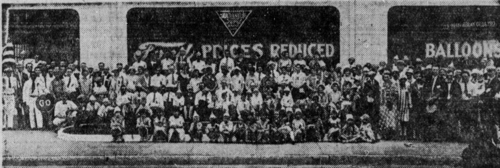
Employees of the Frank Hatfield Company, authorized Ford dealer, and their families, who left all thoughts of spark plugs and balloon tires behind and frolicked on their annual picnic at Walnut Gardens, Sunday, July 18. Forty employees have been present at the picnics for the last six years, a check showed.