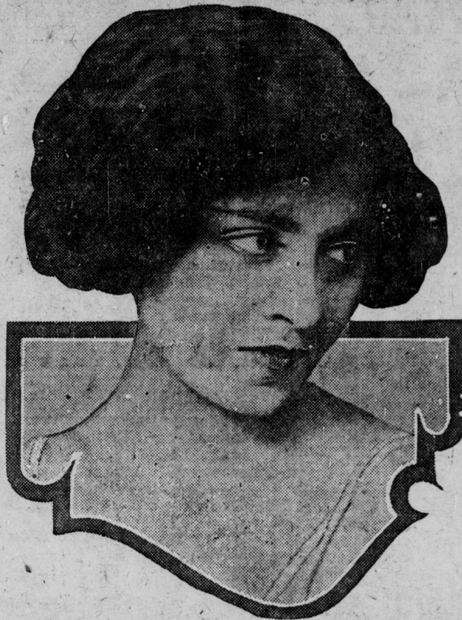
Princess Naidu, of Indian royalty, is considered the most beautiful woman in her country, and is a dancer of renown. European artists call her most perfect of her type.