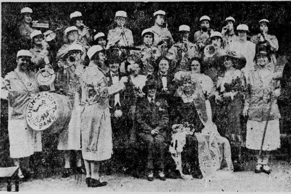
Kitchen Band of the Railway Mail Clerks' Association Auxiliary.

Members of the Railway Mail Clerks' Association Auxiliary use their kitchen utensils to make music. The Kitchen Band of the organization recently entertained inmates of the Marion County Infirmary.