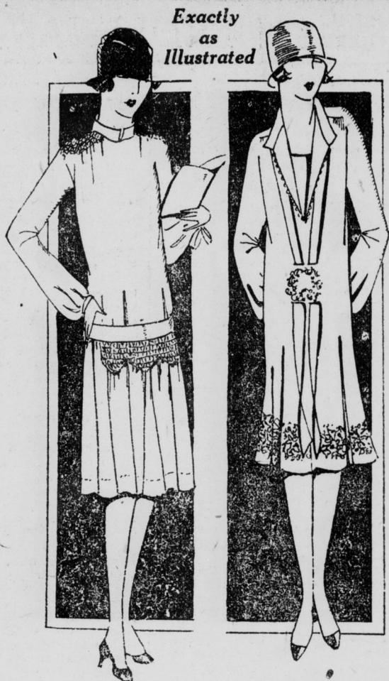
Exactly as Illustrated