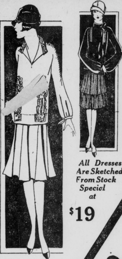
All Dresses Are Sketched From Stock Special at