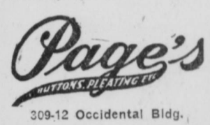
309-12 Occidental Bldg.

Revolution in hemstitching. We have on display a new style: come in and we will be pleased to explain same to you. It is a big improvement over the old style workmanship.