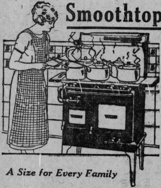
A Size for Every Family