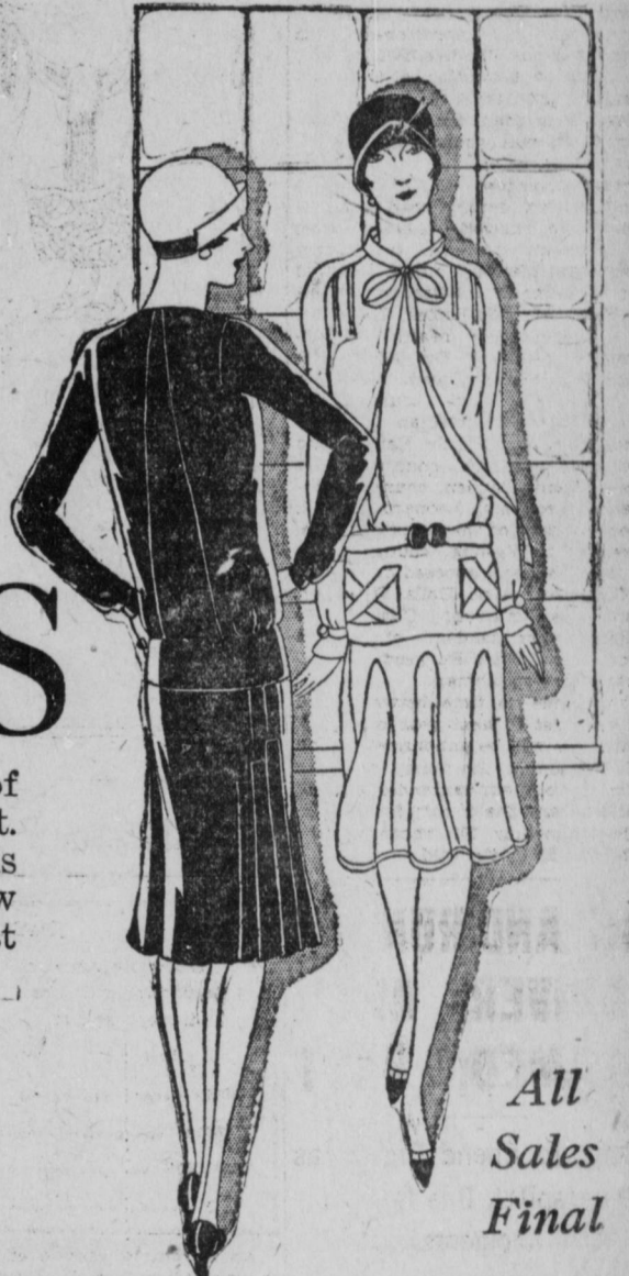
All Sales Final

Truly the Most Remarkable Values Ever Offered in the History of the Hudson Stores