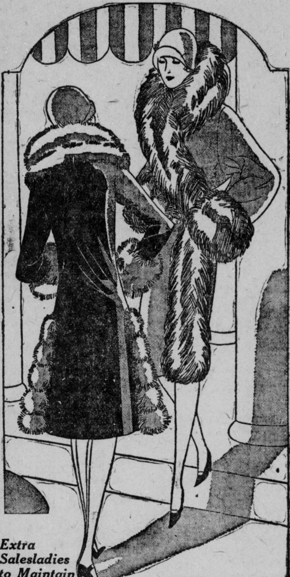
Extra Salesladies to Maintain Our Standard of Service

An Event That Will Be Well Worth the Time of Discriminating Women to Investigate