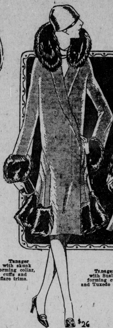
Tanager with skunk forming collar, cuffs and fare trim.