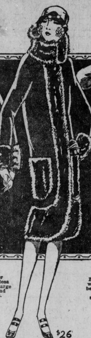
Tanager with Mendoza beaver in large pockets and bannings.