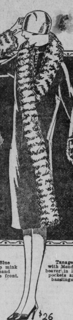
Jay Blue with Jay mink in a band down the front.