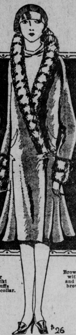
Tanager with Suslik forming cuffs and Tuxedo collar.