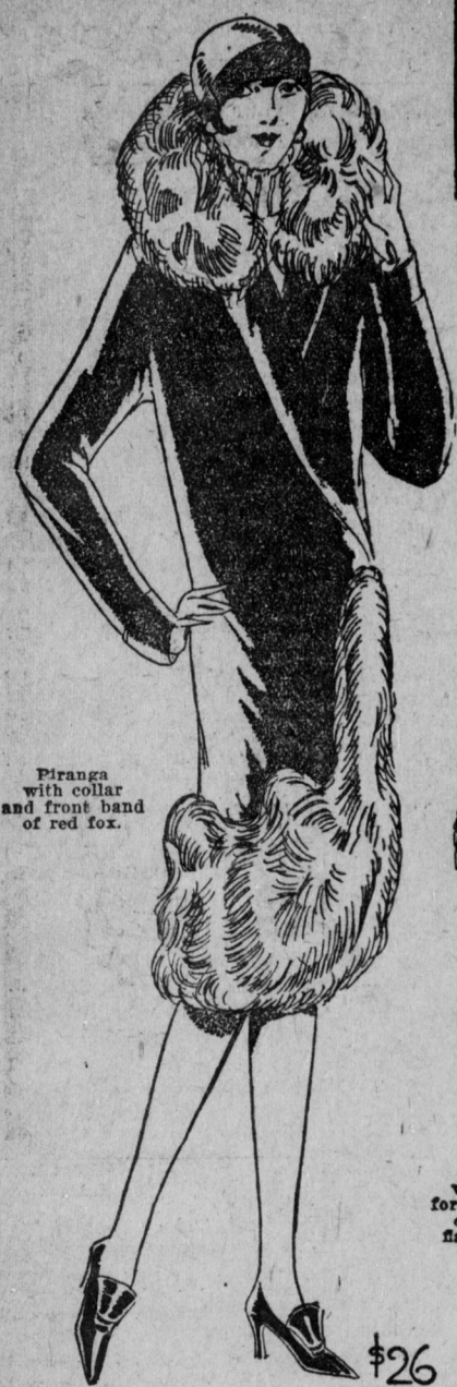
Piranga with collar and front band of red fox.