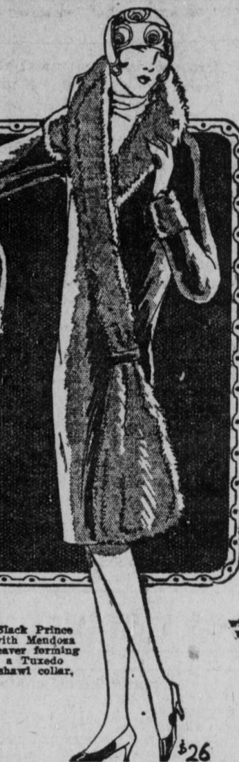
Black Prince with Mendoza beaver forming a Tuxedo shawl collar.