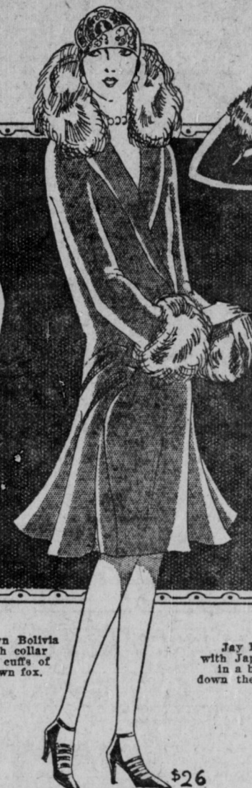
Brown Bolivia with collar and cuffs of brown fox.