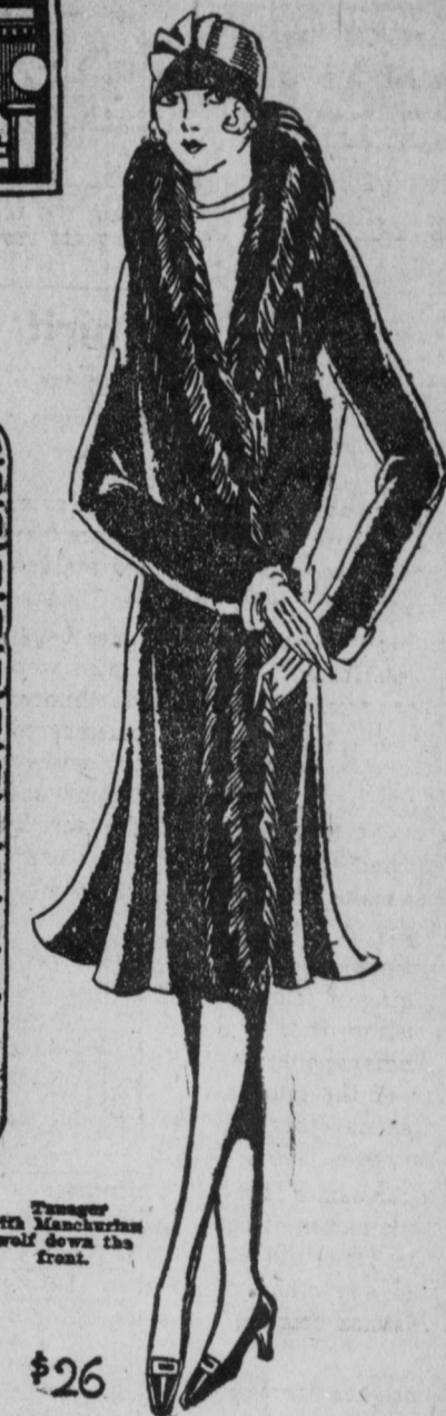
Tanager with Manchurian wolf down the front.

These Pictures Tell the Story of Our Greatest Basement