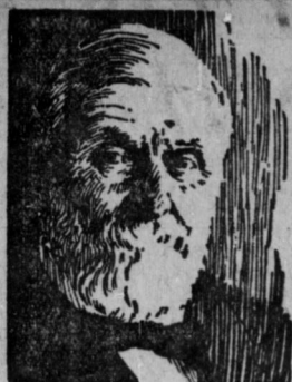
DR. W. B. CALDWELL AT THE AGE OF 83

The letter says, in part: "While we request that complete records be supplied for each candidate for admission, the natural assumption is that every such candidate will be able to complete the minimum residence requirements for a master's degree. In the normal even for those heretofore chronically constipated. Dr. Caldwell's Syrup Pepsin not only causes a gentle, easy bowel movement but, best of all, it is often months before another dose