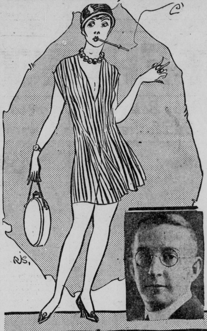
Here's the flapper of 1926, according to specifications laid down by Ernle Young, Chicago theatrical producer.