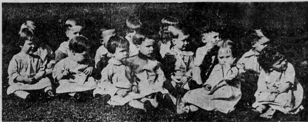
Children at Indianapolis Orphans Home

"All dressed up and no place to go!" D'ye ever see neater, sweeter, little kiddies than these? And every last one of 'em is hunting