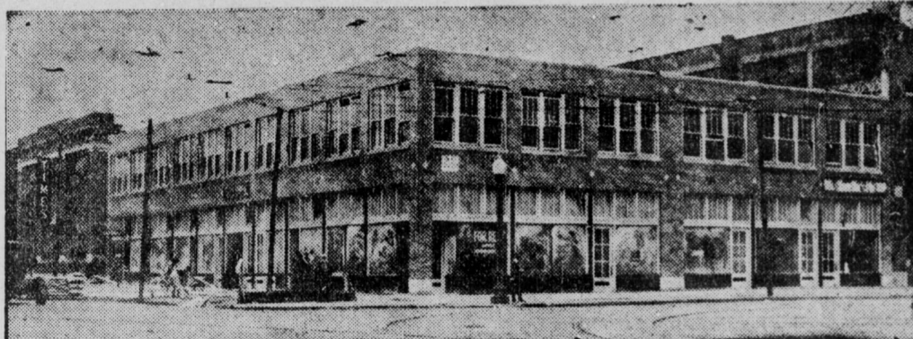
New Building on Times Square

Space in the new building facing on Times Square at Kentucky and Capitol Aves. and Maryland St., is being filled rapidly, according to Otto Guedelhoff, rental agent. Four of the nine business rooms facing on the