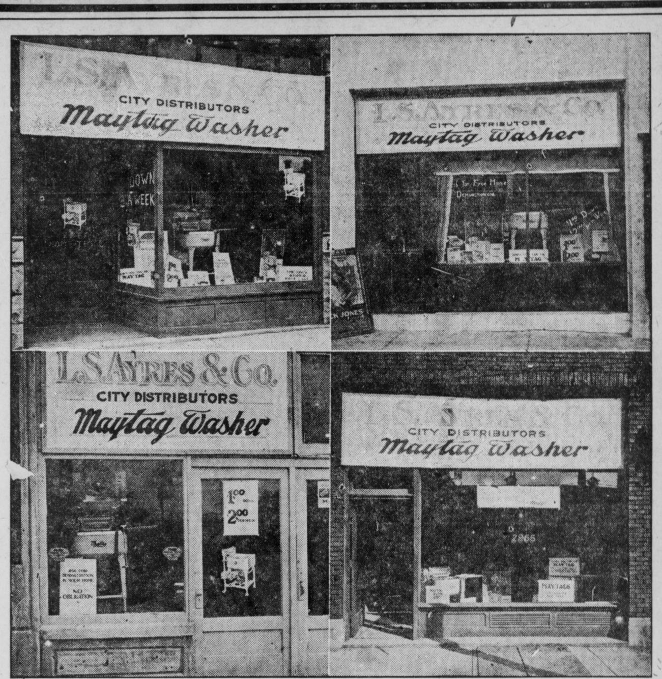
Left Above: 1051 Virginia Ave. Left Below: 5531 E. Washington St.