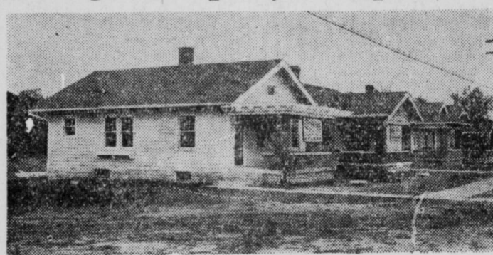
House in Creston Division

The E. L. Cothrell Realty Company has begun construction on some 200 modern bungalows in its new "Creston" subdivision, on the Rockville Rd., where it forms a junction with W. Washington St. Some fifteen houses are now under construction and many more will be built this fall and winter.