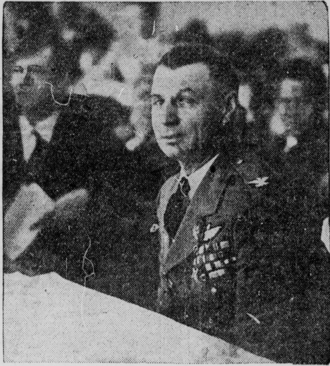
The climax of the presidential commission's investigation into America's aircraft situation came when Col. William A. Mitchell, former assistant chief of the Army air service and bitter critic of the present regime, took the witness stand at Washington. This picture was taken while he was on the stand testifying.