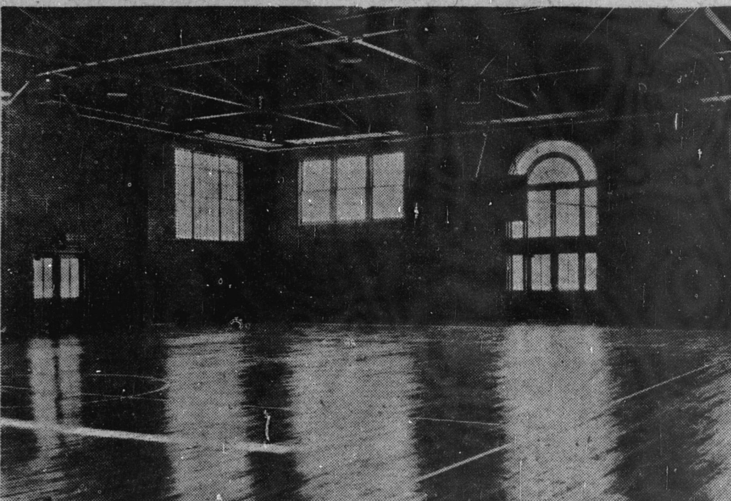
INTERIOR OF NEW BEECH GROVE HIGH SCHOOL GYMNASIUM