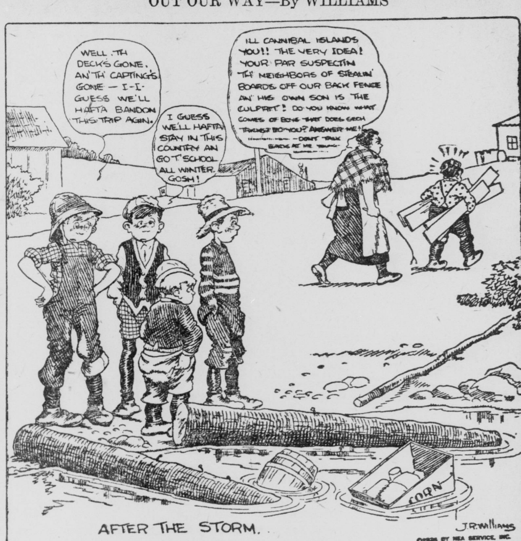
AFTER THE STORM

Every one looked most wonderfully well, especially the two Roosevelts. Mearns and Heller had both grown hard, fine beards, and looked as hard as lions. Kermit's beard was making good progress and he had now adopted the East African custom of wearing short khaki trousers, leaving the knees bare.