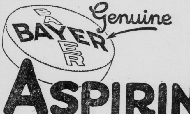
Genuine BAYER ASPIRIN