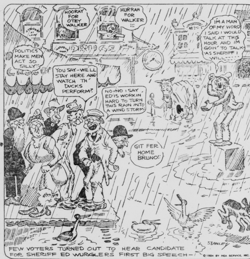
FEW VOTERS TURNED OUT TO HEAR CANDIDATE FOR SHERIFF ED WURLERS FIRST BIG SPEECH