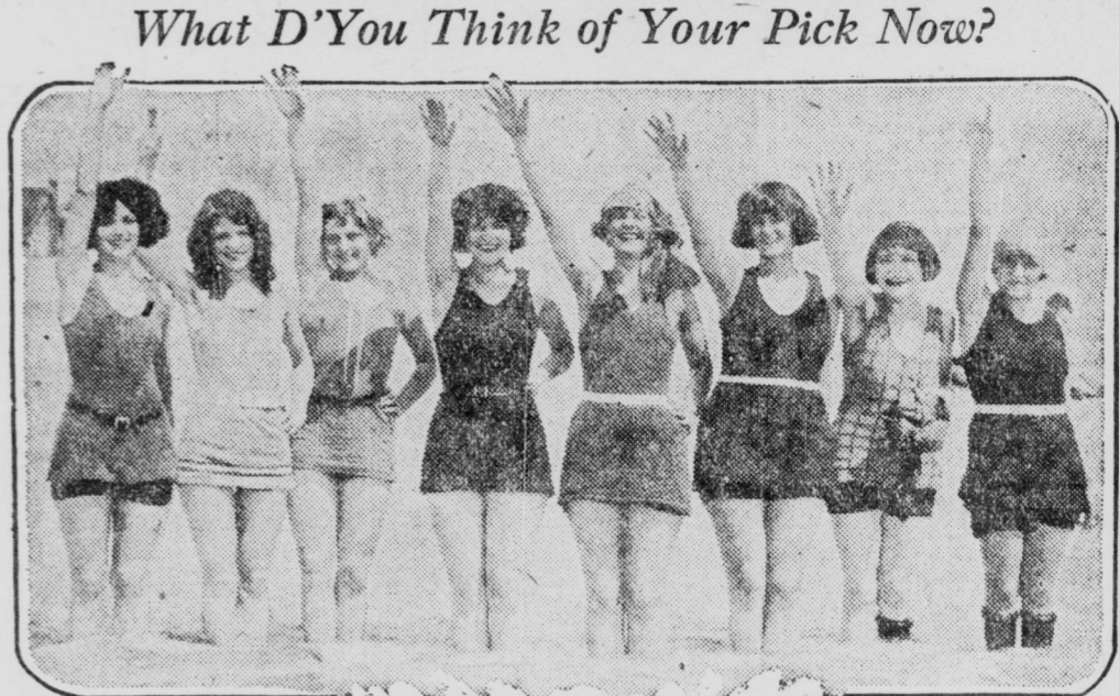
HERE ARE THE GIRLS YOU SAW ON THE FRONT PAGE, IN REVERSE ORDER. DO YOU STILL THINK YOU PICKED THE MOST BEAUTIFUL? A LOT DEPENDS ON WHERE YOU SIT, YOU KNOW.

Thousands Without Protection "Failure of Congress to pass the Fitzgerald-Jones bill to provide workmen's accident insurance for private