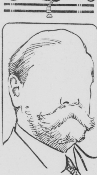
Saturday's Portraiture—GENERAL PERSHING

retary of the department of religious education of the Chicago church federation, in a talk on daily vocation Bible schools, Sunday, at Roberts Park M. E. Church. Object this year is 100 schools with every 10,000 children enrolled.