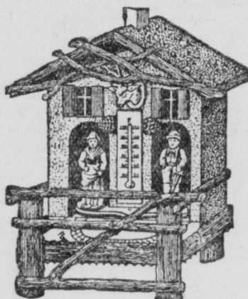
Another Big Shipment From Overseas

Do Your Buying at Brooks' on Saturday and Sunday