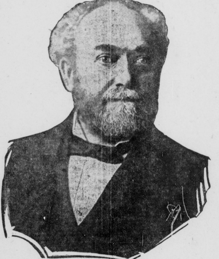
BROUGHT UP ON A FARM

Success absolutely guaranteed or you get back the little it costs for the trial. Ask for and take only Martin's Vitamin, prescribed by doctors, recommended by druggists, athletes, successful, vigorous men, healthy beautiful women and used by millions. At all druggists.