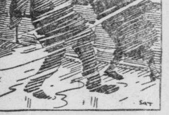
THE STORM MET THE TWO ADVENTURERS WITH A YELL.

He mixed whisky-and-sodas for Lenore and Mrs. Hardenworth, then started to make the rounds of the crew with a bottle and glasses. He did not, however, waste time offering any to Bess. The latter had already evinced an innate fear of it, wholly apart from sentimentality and nonsense.