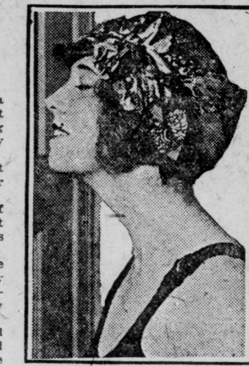
TWO STEPS IN THE "SWAN EXERCISE" TO BEAUTIFY CHIN AND NECK.