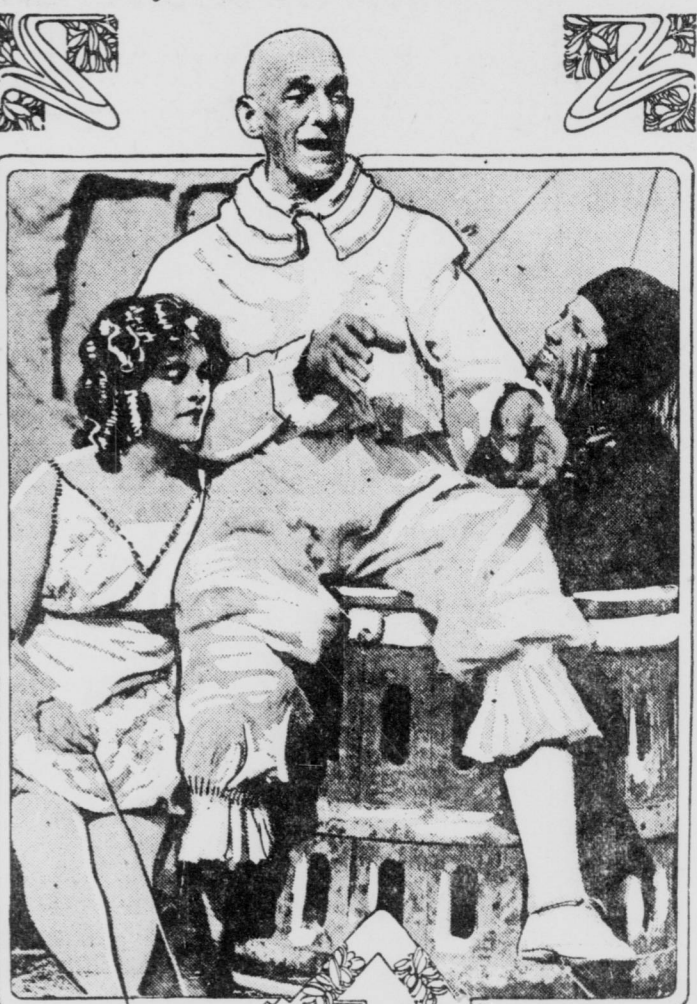
The Old Clown's Story.

Here is a picture of the dean of the clowns with the Ringling Brothers and Barnum and Bailey