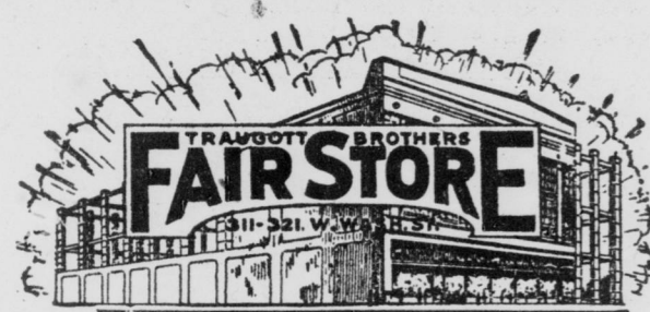
"The Store of Greater Values"

$25 Stout Women's SILK DRESSES Colors are navy, brown and black. Sizes 46 to 52. $5.55