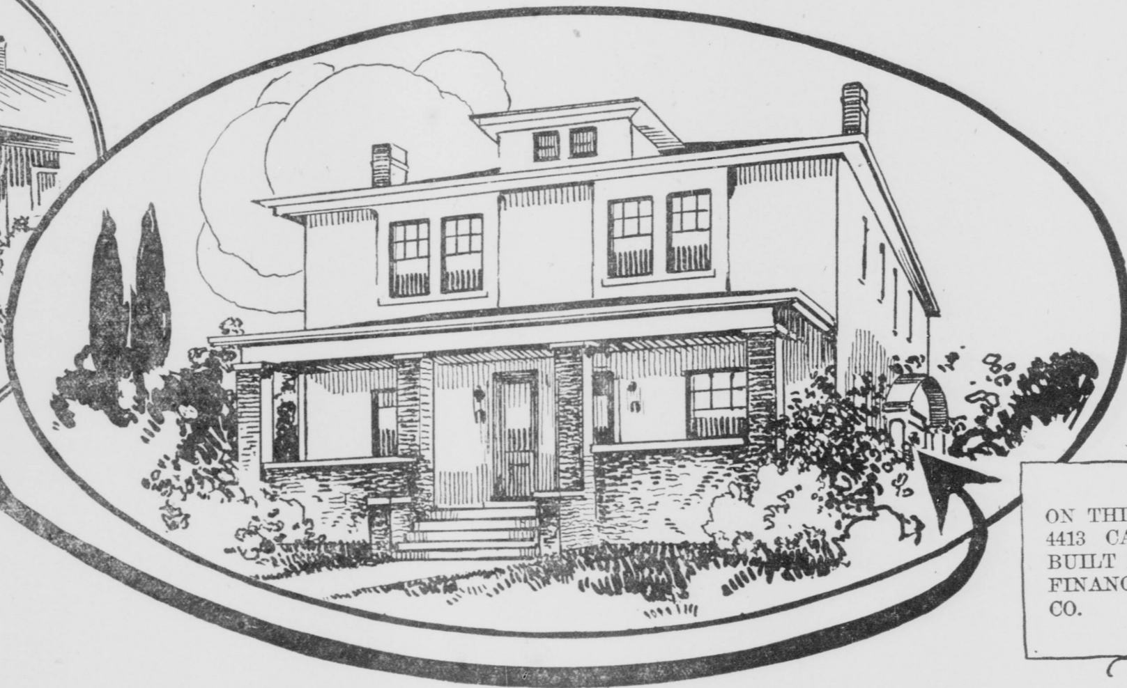
ON THIS NEW HOME AT 4413 CARROLLTON AVE. BUILT BY THE REALTY FINANCE AND BUILDING CO.