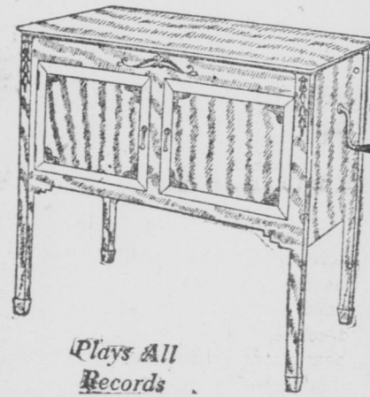
Plays All Records

As musical instruments they are very satisfactory, being equipped with two-spring motor, tone modulator and adequate filing space for records. As pieces of furniture, they are equally so; having no cut work, they give the appearance of a neat console when not in use.