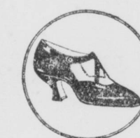
Black Kid Wishbone Strap Spanish Heels

Tables are displayed according to sizes for your convenience in making your selection from the various styles too numerous to mention here.