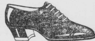
Patent Leather Oxfords, Low and Cuban Heels. Ideal for Street Wear.