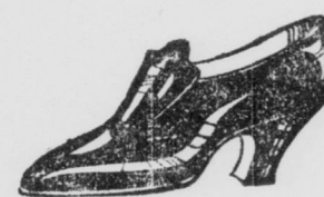
Patent Leather Colonials Spanish Low Heels