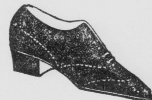
Brown and Black Calf Lace Oxfords, Military Heels. Exceptional Values.