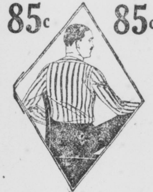
Men's Shirt Sale Continues, 85c

In combination colors, very desirable for school wear. Sizes 7 to 14.