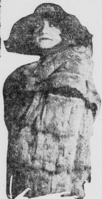
What Local Theaters Offer Patrons Today

PART IV O Gently "The Danube Rolls Its Waters Gently" (Folk-song)..... Koshetz Evening (Folk-song)..... Koshetz The Little Taro (Folk-song)..... Koshetz I Shall Go (Folk-song)..... Koshetz The Shoes (Folk-song)..... Lyssenko The Ukrainian National Chorus