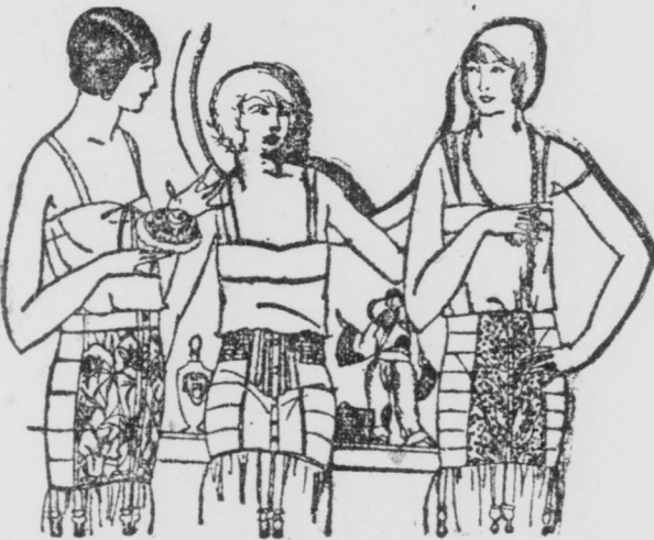
300 Front and Back Lace Corsets, $1.95

Quality merchandise from the Ayres Downstairs Store at prices much below the regular markings—is the feature of the Miscellaneous Sale in the women's wear department. An event well worth your attendance. Come early.