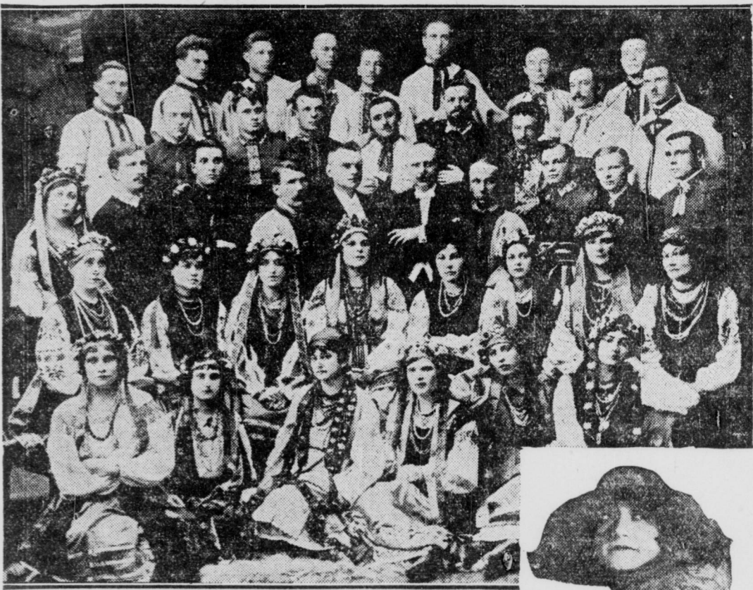
UPPER—THE UKRAINIAN NATIONAL CHORUS AS IT WILL APPEAR IN A PROGRAM OF FOLK SONGS THURSDAY NIGHT AT THE CADLE TABERNACLE. LOWER—MILE. ODA SLOBODSKAJA, NOTED OPERA SINGER WHO WILL BE THE SOLOIST WITH THE CHORUS.

By WALTER D. HICKMAN MILE. ODA SLOBODSKAJA, soprano of the Petrograd opera, will be the soloist Thursday night with the Ukrainian chorus at the Cadle Tabernacle.