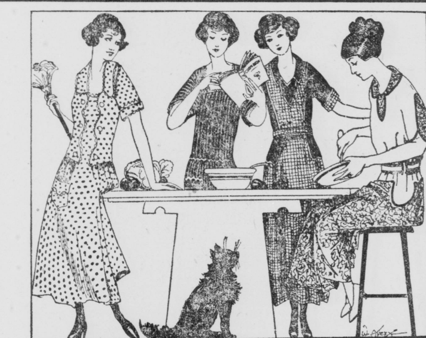
1,500 Bungalow APRONS 79c EXACTLY AS PICTURED.

One remarkable feature of our ready-for-wear department is that practically our entire stock is not over 30 days old.