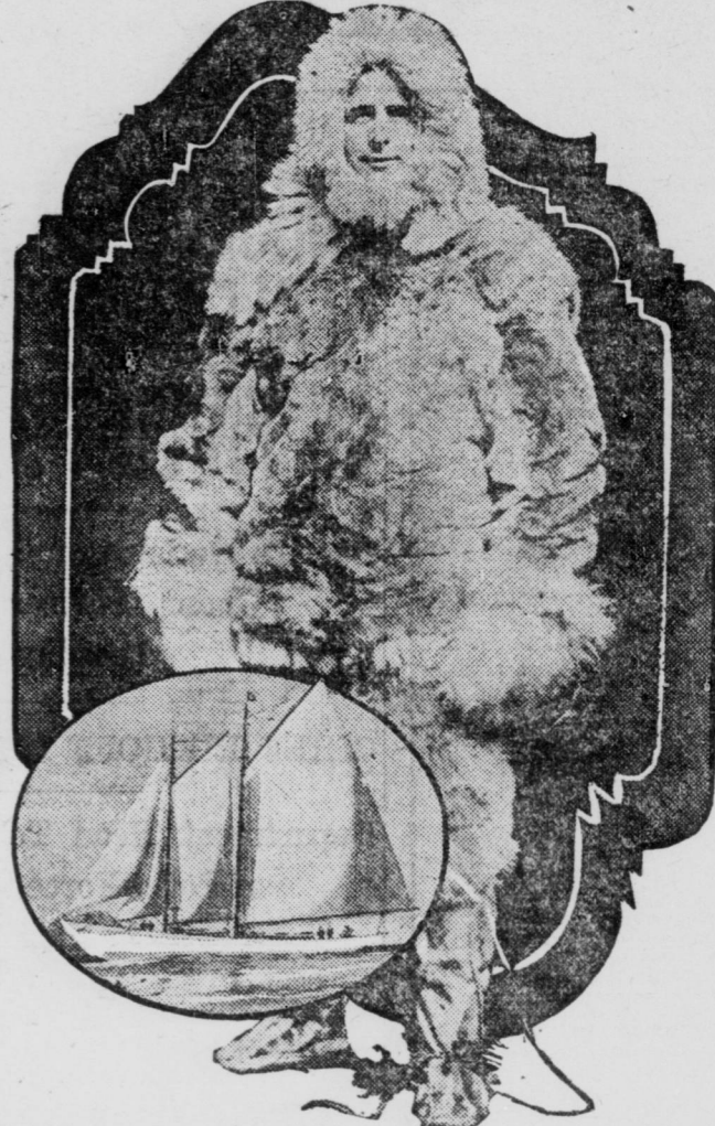
He looks warm enough, even for the Baffin Bay country. Donald B. MacMillan, arctic explorer, who is reported returning from Baffin Bay, after a year's absence on an exploring expedition. Inset is the Bowdoin, in which the expedition sailed from Boston.