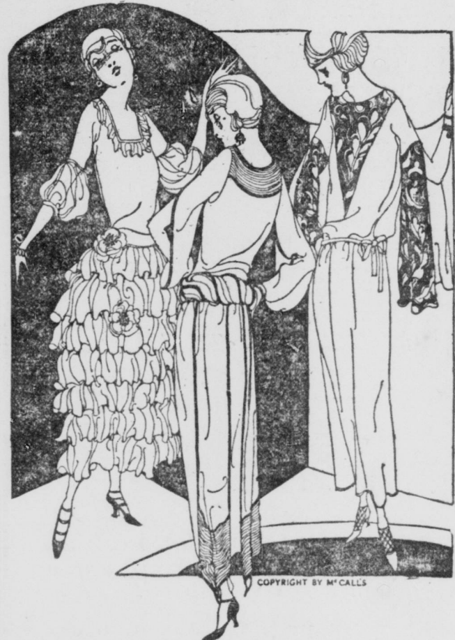
Some one once said that there were "four and forty ways of writing trial laws and every single one of them was right."

He will, perhaps, forgive the more deadly of the species for adopting this slogan to the fashions.