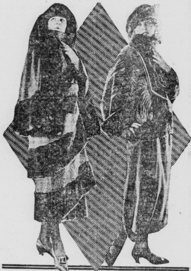
TWO STUNNING WINTER OUTFITS. AT THE LEFT, ONE OF THE NEW COATS OF BROWN WOOL, BANDED WITH BEAVER. AND A WINTER SUIT ALSO OF BROWN, EMBROIDERED AND FUR TRIMMED.

By MARIAN HALE Now that you have done your fur shopping early and probably spent your dress income for several months ahead, along come the alluring cloth coats and suits. They are so very attractive they are sure to give you anxious moments and make you wonder if, after all, you bought wisely.