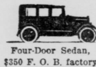
Four-Door Sedan, $350 F. O. B. factory

White Furniture Co. 243-249 W. Washington St. Opposite State House.