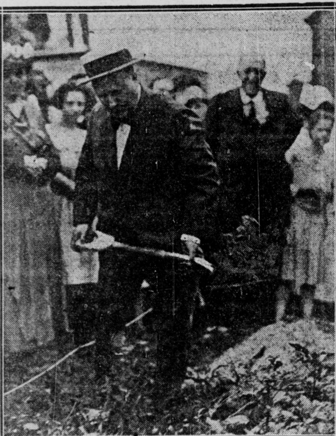
Governor McCray handled a spade as if he had done it before when he turned over the first earth in the erection of the Riley Memorial Children's Hospital.