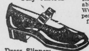
Dress Slippers for Misses and Children