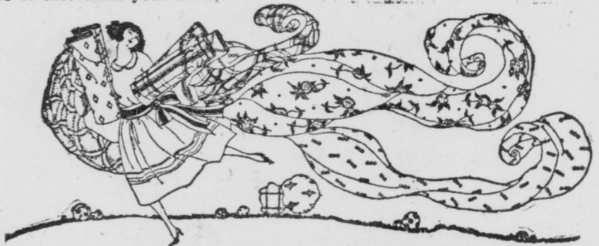
—Ayres—Wash goods, second floor.

Imported. Grounds of navy and Copenhagen blues, black and tan, with checks and embroidered spot dots, as it were, in white, green or tan. A novelty that will at once claim your favor.