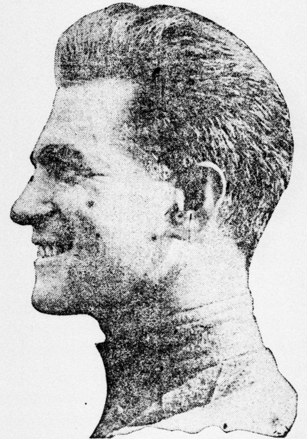
RALPH DE PALMA